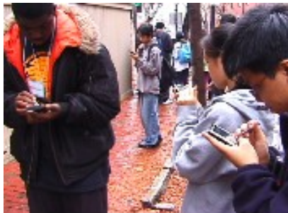
Figure 4: Students Exploring School Grounds